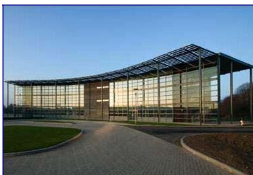
Environment Agency Offices, Red Kite House, Howbery Park, Wallingford (Scott Brownrigg Architects - www.scottbrownrigg.com )