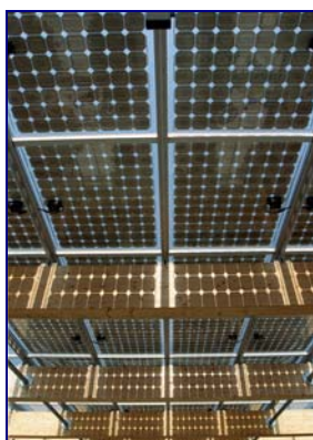
Photovoltaic, Jubilee Campus, Nottingham

There is limited potential to use hydro technology for electricity generation within the Oxford City boundaries. The potential for such schemes depends on the volume of water flow and the level of head (vertical drop of water), which needs to be a minimum of 1.5m. Locations that might be suitable are old mill sites and river weir structures.