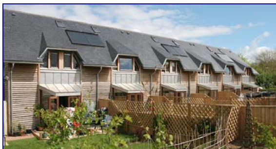
Eco homes at Oak Meadow, South Molton, Devon