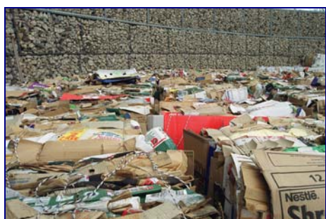
Recycling facilities

Designing buildings and their details with deconstruction in mind enables the building at the end of its useful life-span to become the resource for future developments and complete the resource cycle. Designing buildings with their deconstruction in mind will help minimise the future costs involved in sending waste to landfill, provide materials for the replacement of the building or resale if appropriate when the building reaches the end of its life-span. This responsible outlook can also help avoid financial penalties in the future due to changing legislation as legislation in this area is likely to be tightened over time. A deconstruction plan and product / material index can be produced to document the areas addressed in the design and assist with deconstruction in the future. Examples of ways to ensure materials are recycled rather than wasted in the future include: avoiding composite materials; using lime-bases rather than Portland cement for mortar and renders to enable easier recycling of bricks; using mechanical fixings rather than adhesives; and using dry construction techniques where possible.