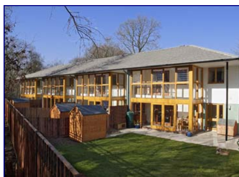
Beaufighter Road development, West Malling, Kent (Fry Drew Knight Creamer Architects)