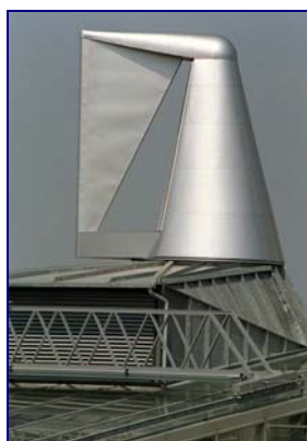
Natural ventilation wind cowl, Jubilee Campus, Nottingham

The use of green and brown roofs can also increase energy efficiency. A green roof is one that has been surfaced with a growing medium, with vegetation on top of an impermeable membrane; brown roofs work on the same concept but with a broken substrate replacing the organic growing medium. Intensive roofs have a deep layer of soil, and can grow and support lawns and shrubs and are designed for people to use; extensive roofs have a shallower layer of soil, are generally planted with mosses and sedums and are not designed for such use. Green and brown roofs can provide buildings with more thermal mass (see below), prolong the life of the roof, reduce sound transmission, moderate surface water run-off, provide green space for wildlife and people, and look attractive. The average weight of a fully saturated extensive roof is comparable to the weight of a gravel ballast conventional roof.