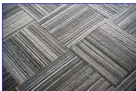
Recycled tiles