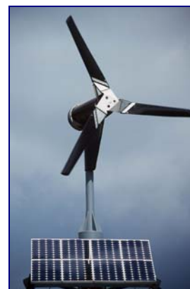
Sainsbury, Greenwich